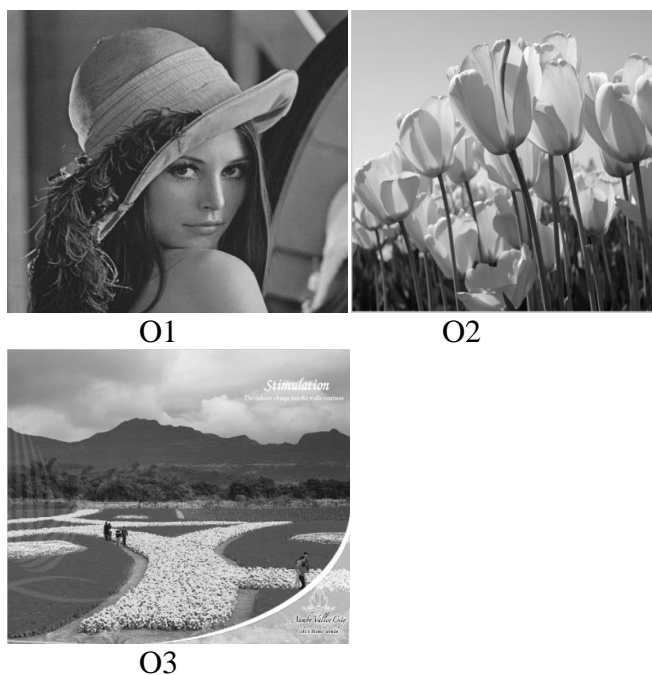
Figure 3.1 Test Images used for experimentation. Original Images (O1, O2, O3).

In the experiment, the three techniques are applied on different images. The brief introduction of the above techniques is given in Introduction section. Different test images are used for the experiment. These images are shown by Figure 3.1 and 3.2.